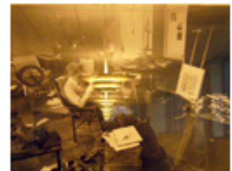
"John Marin in his Studio, Hoboken, N.J."