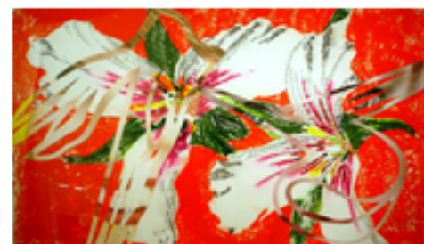
"Sister Shrieks" by James Rosenquist