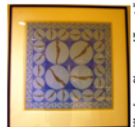
"Shadows, Planes and Targets" by Ernest Trova

In the downstairs hallway outside the Lilly Music Library is James Rosenquist's "Sister Shrieks". If you exit the Granoff Music Center from the rear door near "Sister Shrieks", you can see "Planar Mountain" by Richard Hunt near the back of the Aidekman Arts Center.