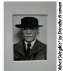
"Alfred Stieglitz 2" by Dorothy Norman

When you walk into the library, straight ahead is "Shadows, Planes and Targets" by Ernest Trova. Walking past the circulation desk, see the four Dorothy Norman photographs of artists. On the wall adjacent to this group is the Arthur Rothstein photograph "John Marin in his Studio, Hoboken, N.J."