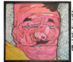
"The Little Fascist" by Paul Stopforth

Walk through the Slater Concourse Gallery and see the display case on the left filled with small figurines and sculptures from around the world.