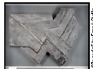
"Bogoria" by Frank Stella