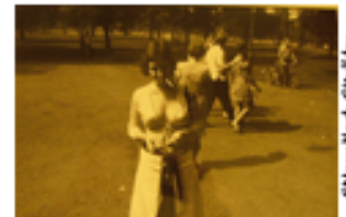
"New York City" by Gary Winogrand